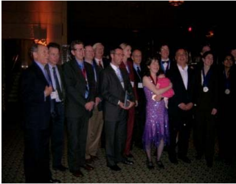
Young scientist awardees with laureate scientists, New York Academy of Sciences Annual Gala 2008