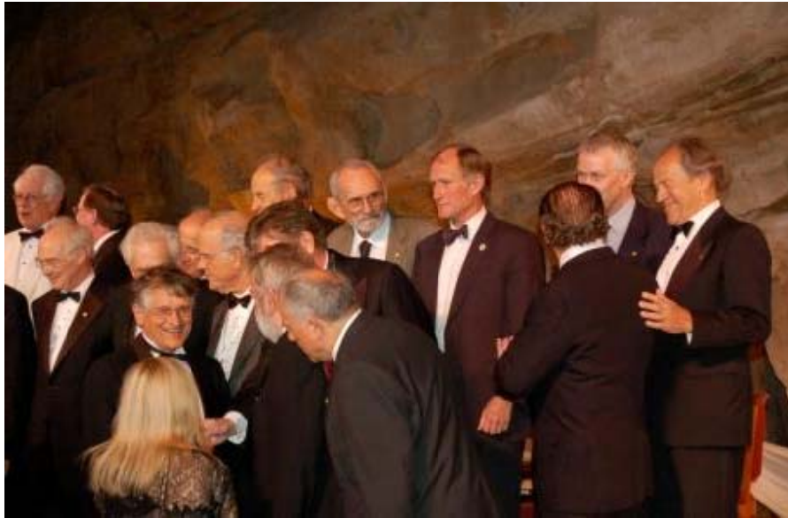
Petra Conference of Nobel Laureates, hosted by Elie Wiesel

“The international community of scientists may help to abolish war by setting an example to the world of practical cooperation ending across barriers of nationality, language and culture.”